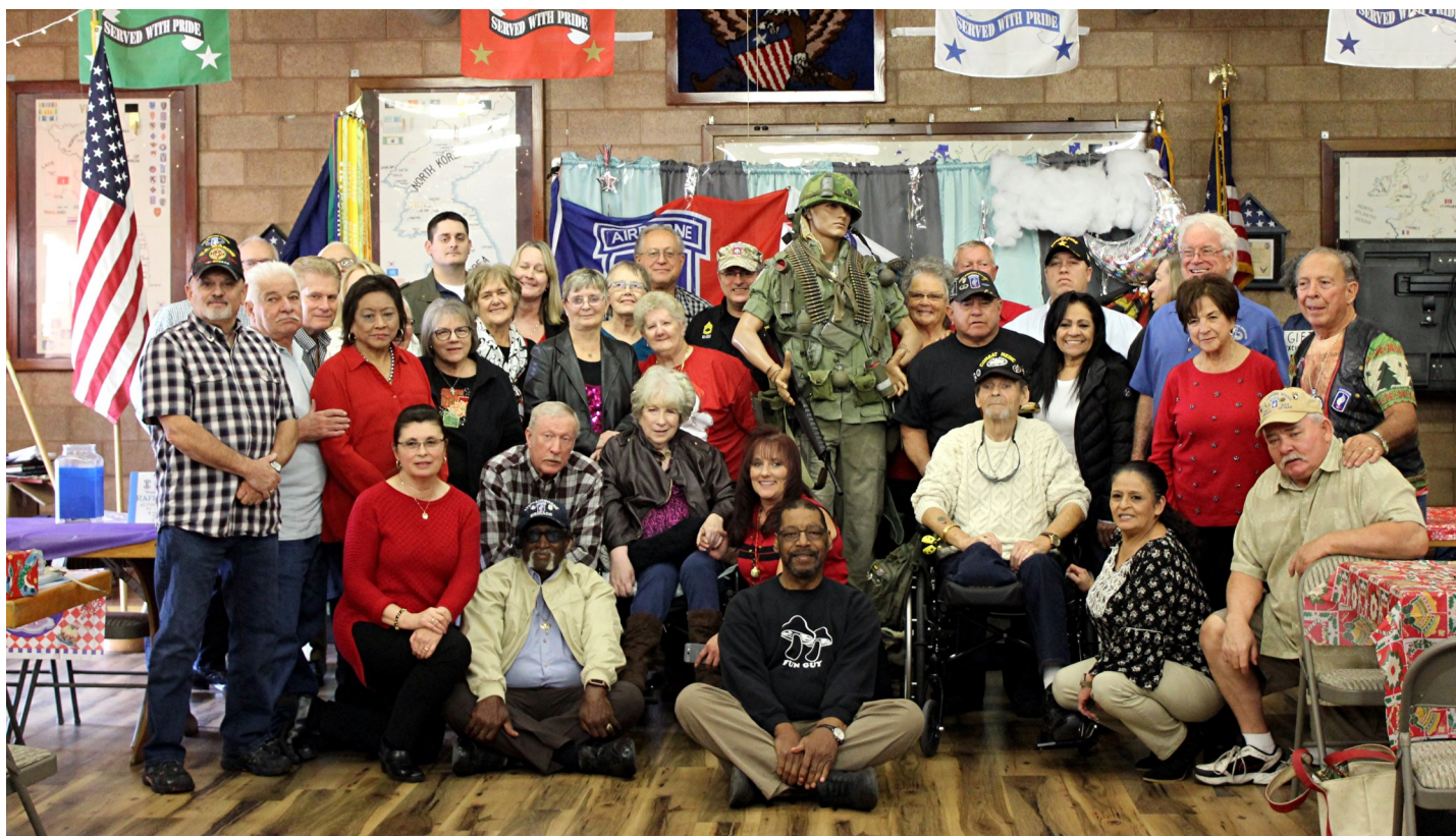
Chapter 10 Christmas Party December 2017