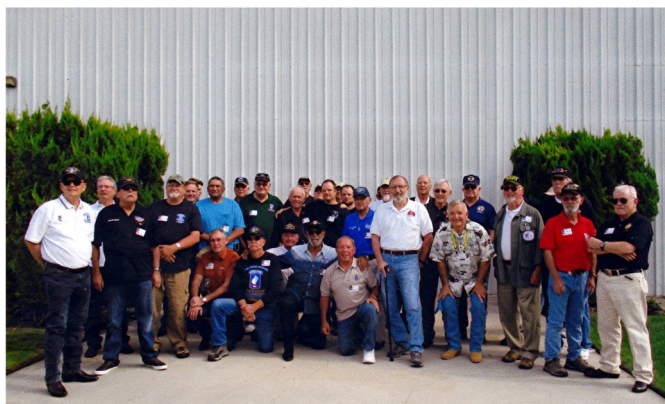
Members from Chapters 10, 14, and members of the 335th Assault Helicopter Co. (Cowboys), and Casper Aviation Platoon.

In 2017 we had 17 different venues that involved a 173rd Chapter 10 member. I am so proud and honored to be part of this special brotherhood! Proud, not for what I have done, but for all our members, friends, and families that get involved with our many different events that we have throughout the year. Whether it's a single mission or in support of our group gatherings that make it possible to help others when and how we can. As I have said many times before, we are a volunteer group and it is always a combined effort.