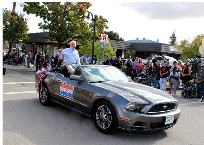
Congressman, Vietnam Veteran and Sky Soldier Mike Thompson in the Petaluma Veterans Day Parade.