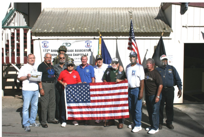
First Generation Sky Soldiers

2015 was a milestone for Vietnam-era Sky Soldiers; it marked the 50th anniversary of the Brigade's arrival in Vietnam and the start of the Sky Soldier legacy. Over the next six years,