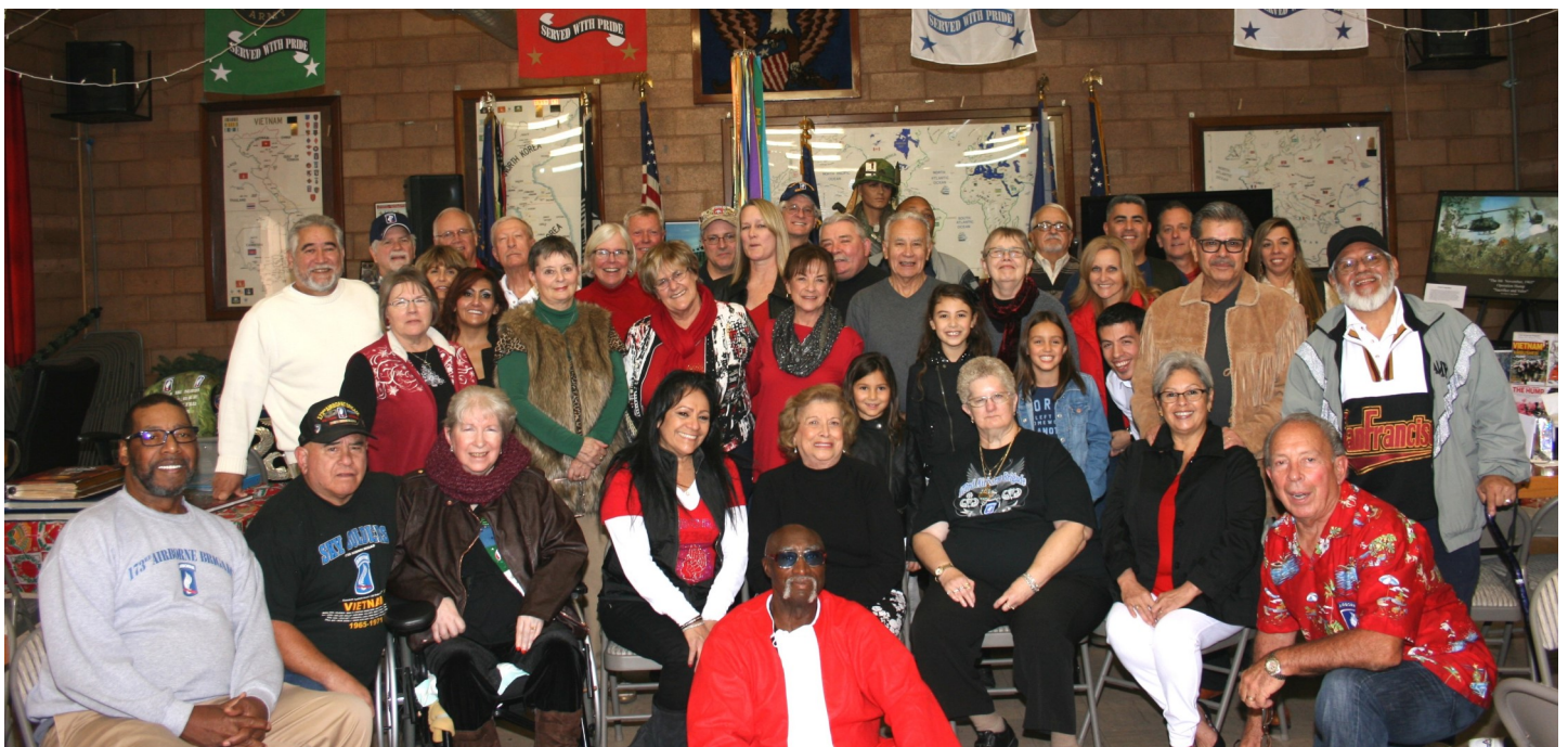
Chapter 10 members with family and friends, Christmas 2015