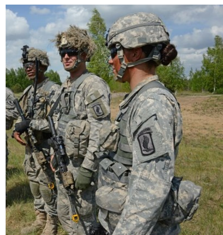
New Generation Sky Soldiers

Provinces, the Korangal Valley, and the eastern mountains of Afghanistan. They also saw extensive action in Logar and Wardak Provinces. Today the 173rd