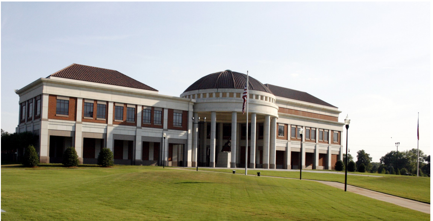
The National Infantry Museum and Soldier Center