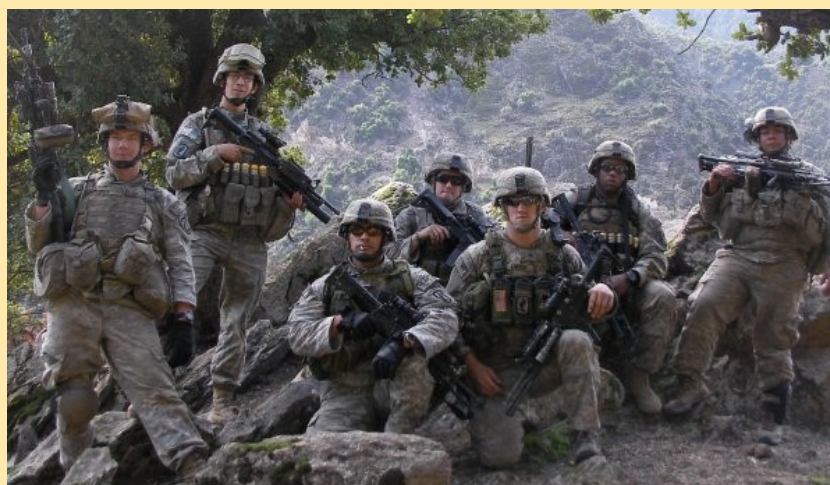
On Patrol March 2008 Near Outpost Bella Operation Enduring Freedom VIII

I was feeling pretty confident about my initial meeting with the guys. I wasn't a cherry and I had two deployments under