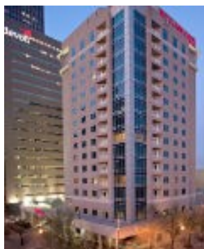
Renaissance Oklahoma City

Oklahoma City, OK 17-21 May 2017 Register Today!!!!