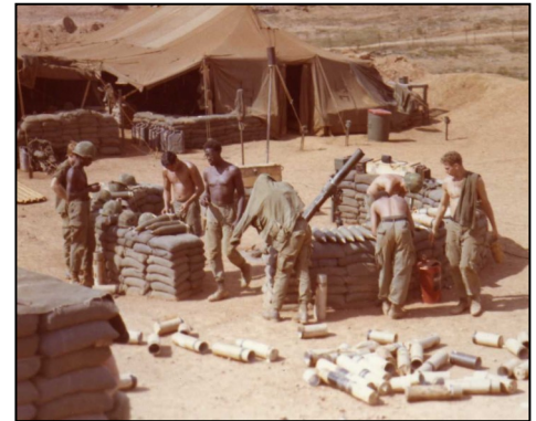
Heavy Weapons Platoon E Company, 4 th Bn 503 d Inf, 173 d Abn Bde Fire Support Base Causeway, RVN 1970