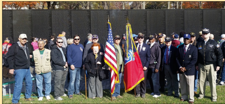
Those there so others would not be forgotten